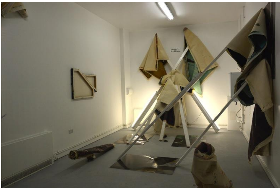
ATOI / ATOI&Cull / 2013